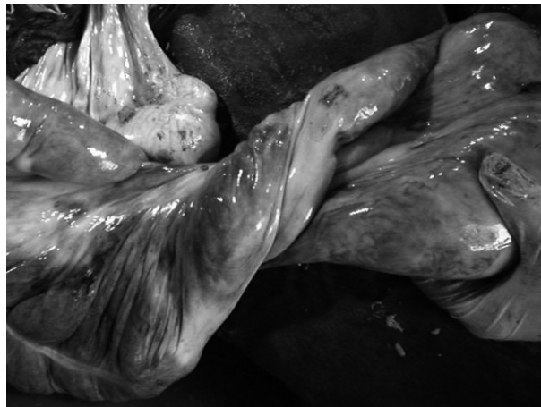
Figure 3. Detail of the colonic torsion in the vicinity of the inguinal ring. Both, proximal and distal segments show venous congestion and haemorrhages

Surgical resolution was recommended to the owner, but this was declined and the owner decided on sacrifice of the stud because of financial reasons.