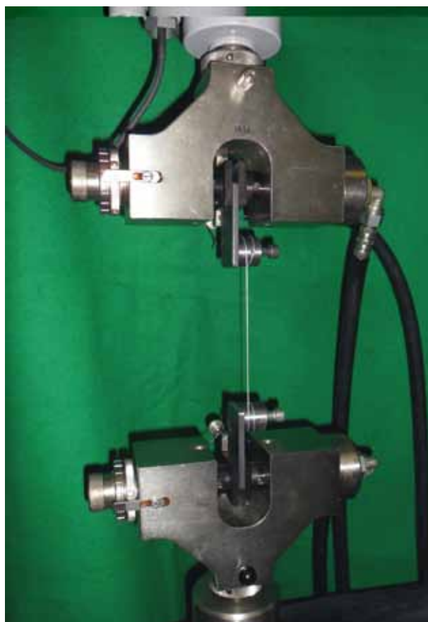
Figure 1. Wrapped material construct on the servo-hydraulic material-testing machine

Three samples of each suture were tested for load to failure. Material testing was performed using a servo-hydraulic materials-testing machine (TIRatest 2300, VEB TIR NDR). The Certificate of Authentication number of the machine was 0305/323.04/11. The samples were divided into