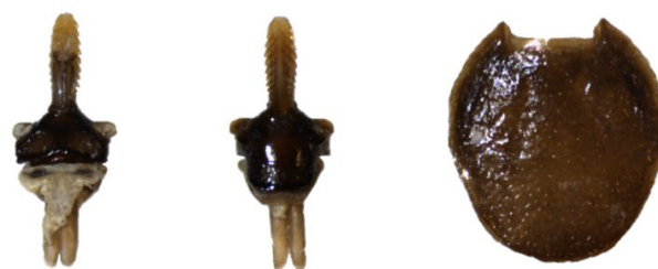
Figure 1. View of the gnathosoma (dorsal and ventral) and scutum of the examined female tick, Ixodes ricinus

Case 2. An adult male raccoon dog in adulthood, weighing 7.04 kg, was shot in October 2017 in the Granowo commune (52°13'N 16°32'E) and was subjected to external examination. Two ticks were found on the right ear and placed in ependorfs with ethyl alcohol until further analysis. After the section was performed, no black nodules were detected in the subcutaneous tissue. Based on microscopic observation, the externally collected