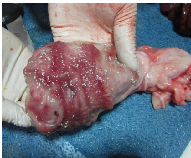
Figure 1. Bladder examination of the cattle that did not have clinical symptoms. A small round-shaped calculus was observed in the bladder, and the bladder mucosa was reddened and thickened

curred in one of the remaining 23 cattle. When the steer was emergency-slaughtered in the slaughterhouse, the veterinarian confirmed the presence of calculi in the bladder and urethra. Bladder examination revealed calculi of varying sizes as well as haemorrhage in the mucosal membrane. Furthermore, one calculus was blocking the urethra. Although no clinical symptoms of urinary calculi were observed in the remaining 22 cattle, we hypothesised that bladder calculi were potentially present in the other cattle of the same age that were raised under the same feed management. We visited the slaughterhouse during the slaughter of the remaining 22 cattle and examined them for the presence of calculi. Various types, sizes and numbers of calculi were present in 11 of 22 Hanwoo steers (Table 1). The bladder mucosa was reddened and thickened (Figure 1). Bladder tissues were fixed in 10% neutral-buffered formalin and embedded in paraffin wax, and sections (3–5 \mu m) stained with haematoxylin and eosin were examined histopathologically